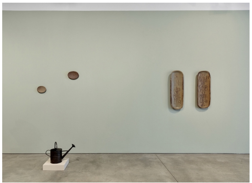
Installation view of Ian Hamilton Finlay: "The garden became my study" at David Nolan, New York

In Egyptian mythology, Osiris is the god of the underworld who grants the dead everlasting life. He is associated with the coming of spring and the yearly flooding of the Nile, which, in ancient times, made the land around it fertile. Osiers are willows that grow in wet habitats; their flexible shoots and twigs are used for basketry and furniture. By linking the two — one is the product of man and the other something found in nature — Finlay asks us to recognize the way we deal with nature and natural resources. Are we committed or not to the renewal of a resource?