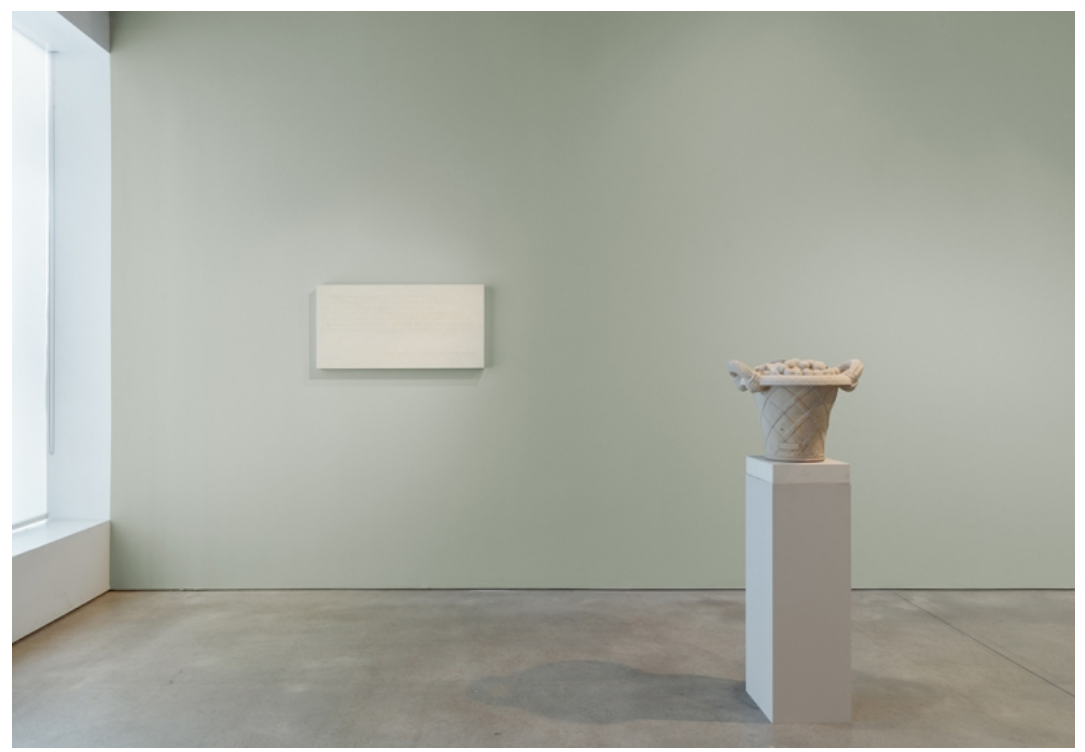
Installation view of Ian Hamilton Finlay: "The garden became my study" at David Nolan, New York

Ian Hamilton Finlay, Marcel Broodthaers and Cy Twombly: I see them sitting in a neoclassical gazebo overlooking a shimmering lake, talking passionately about poetry, different kinds of script (from handwriting to calligraphic lettering to typefaces), gardens, and the distinction