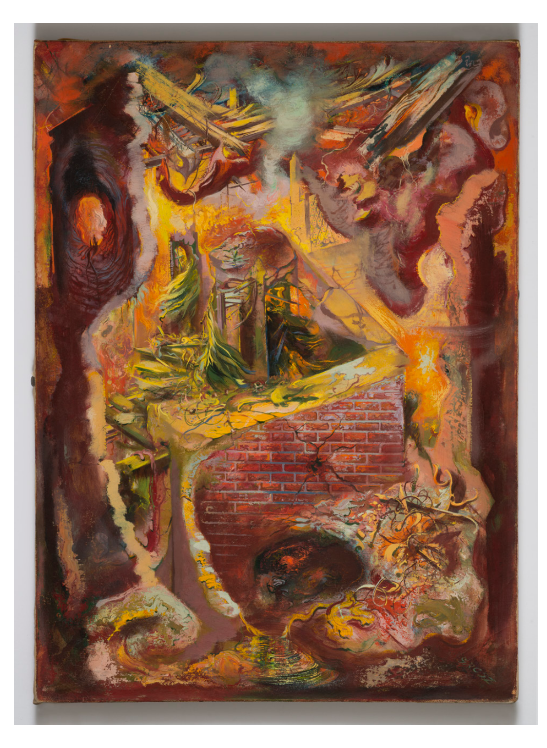
GEORGE GROSZ Retreat, 1946 oil on canvas 30 1/8 x 22 1/4 in / 76.5 x 56.5 cm (GG7045)