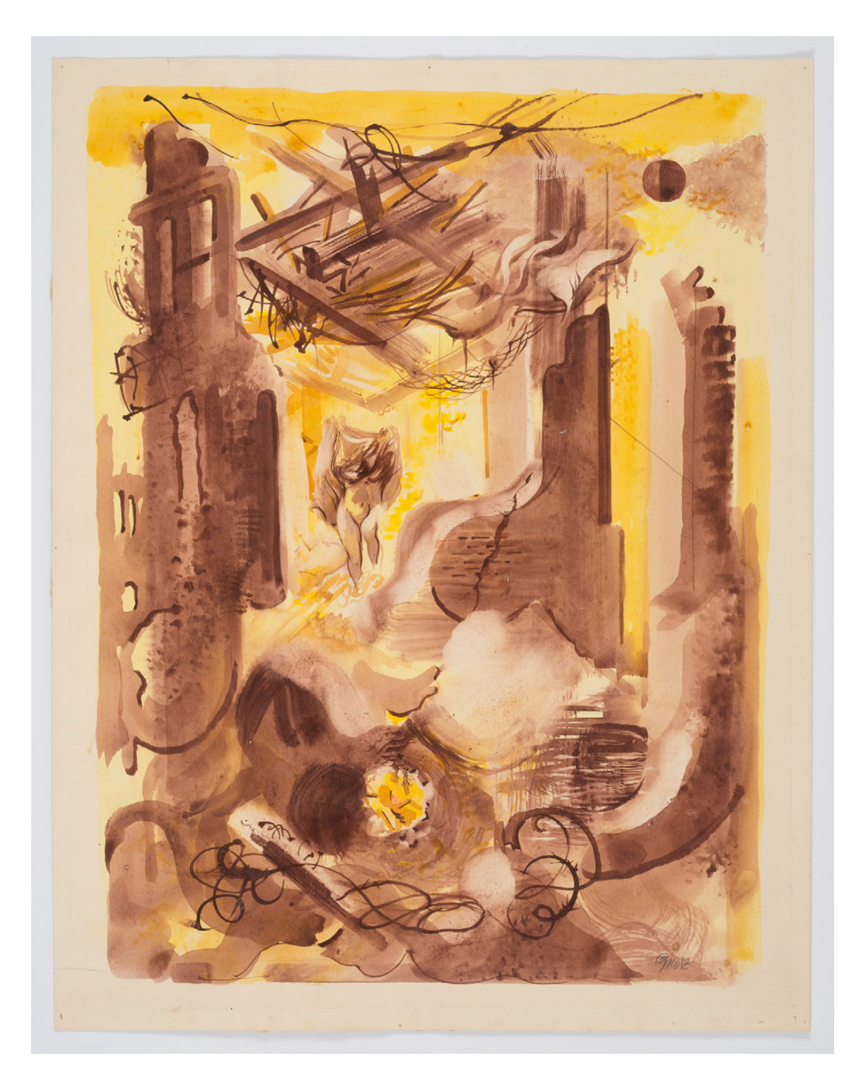
GEORGE GROSZ Burning House and Nude, ca. 1946 watercolor on paper 19 5/8 x 15 3/8 in / 49.9 x 39.2 cm (GG7050)