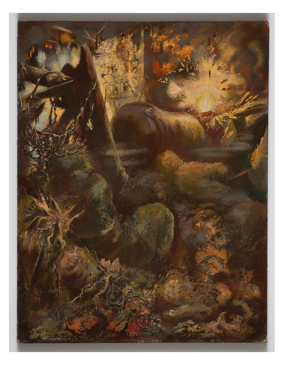
GEORGE GROSZ So Smells Defeat It Haunts Me, 1945 oil on canvas 26 1/8 x 20 1/2 in / 66.5 x 52 cm [GG7058]