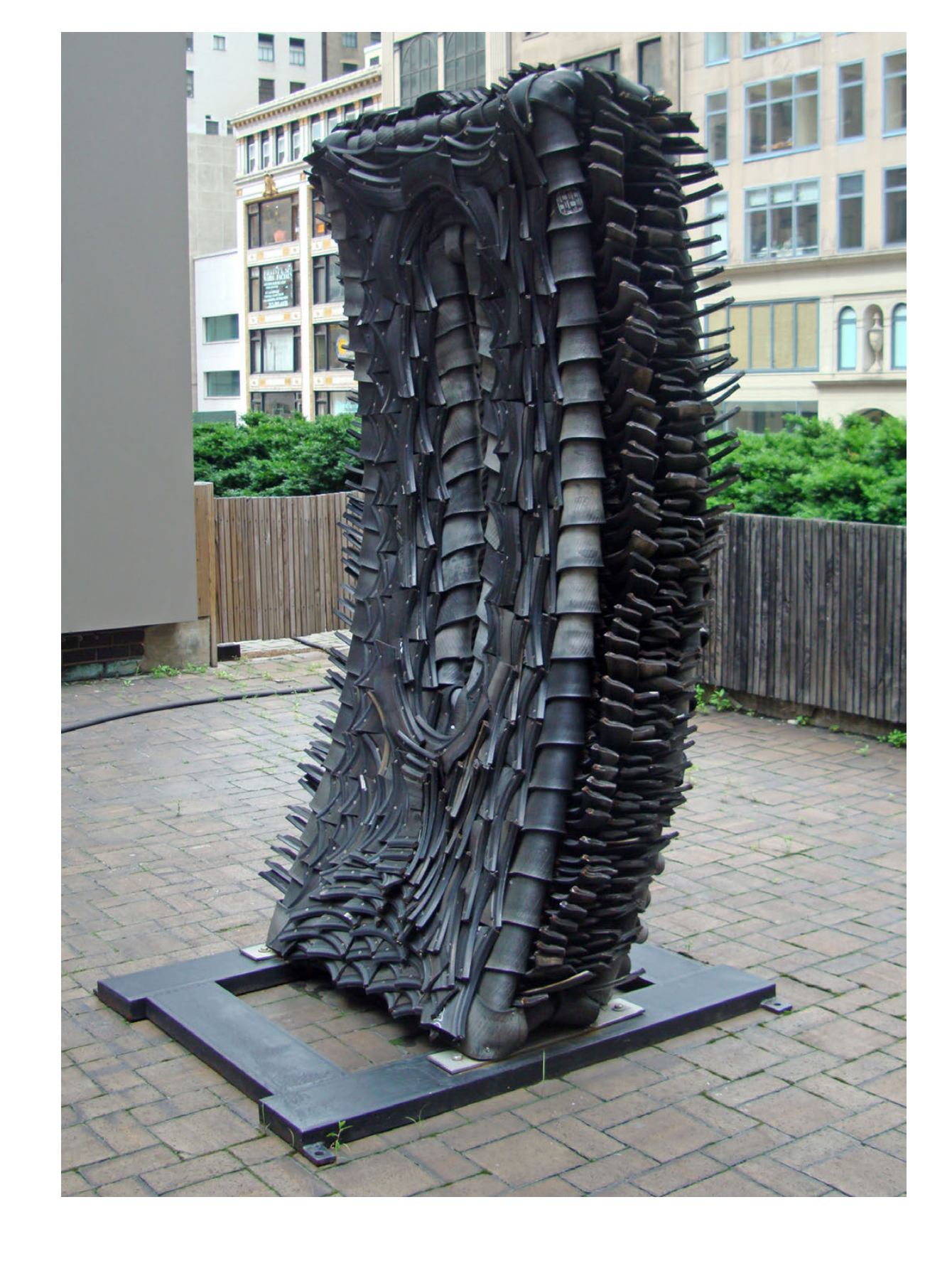
Added Substance, 2008 rubber tires and stainless steel 96 x 45 x 57 in (243.8 x 114.3 x 144.8 cm) (CHB8956)