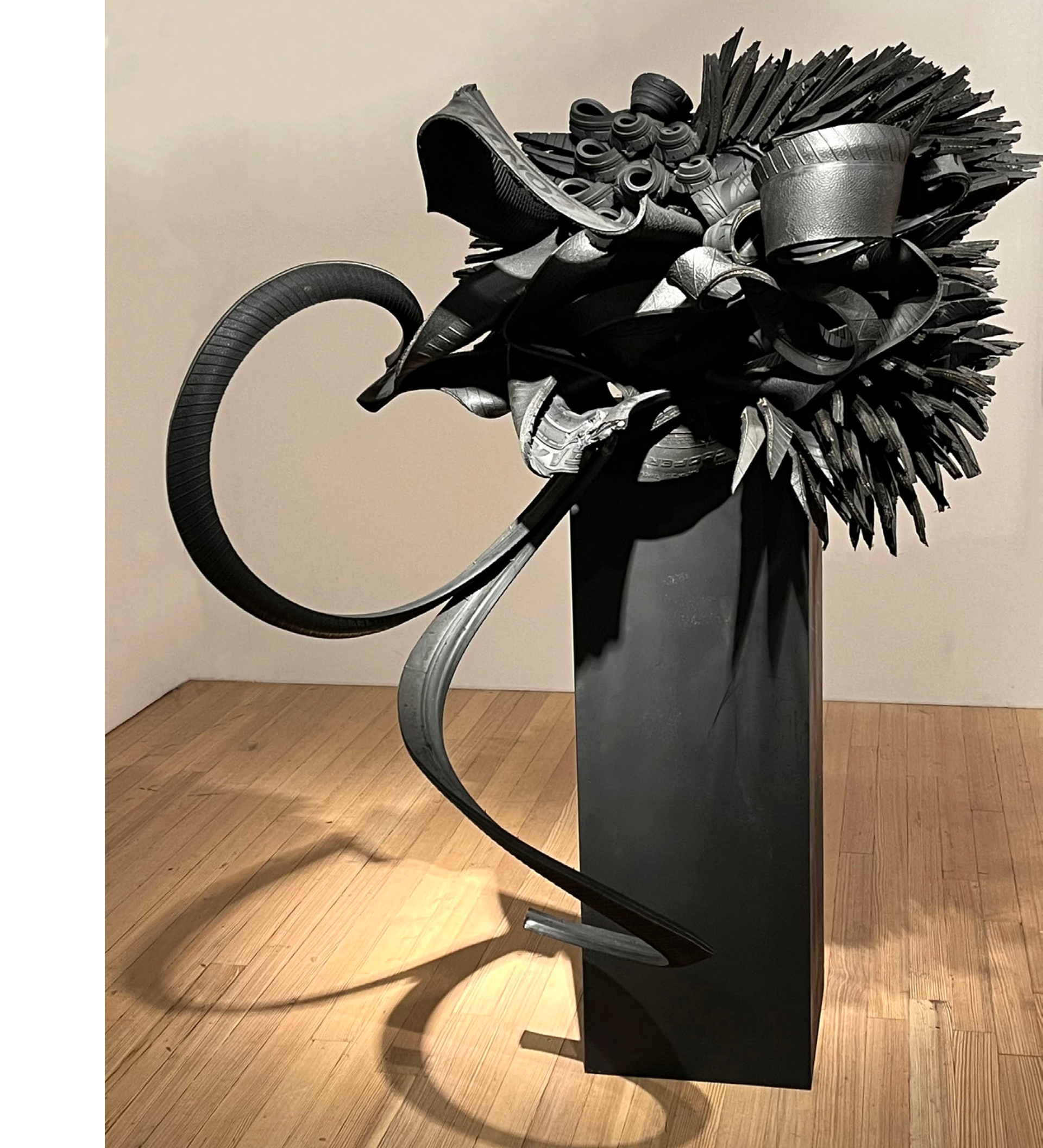
The Host, 2023 rubber tires, wood, and steel 33 x 32 x 35 in (83.8 x 81.3 x 88.9 cm) (CHB8959)